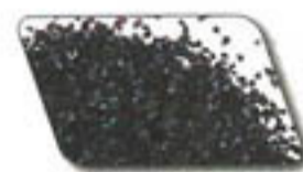
Carbon Cap - Granular Activated Carbon removes chlorine, unpleasant tastes and odor.