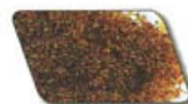
High Capacity Cross-Linked Cation Resin - Higher capacity to remove iron and hardness minerals.