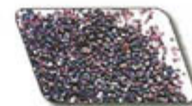
Garnet - Provides sediment filtration and promotes even distribution.