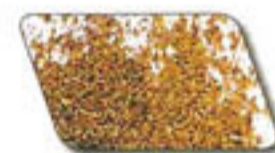
KDF - Inhibits bacteria growth and removes heavy metals.