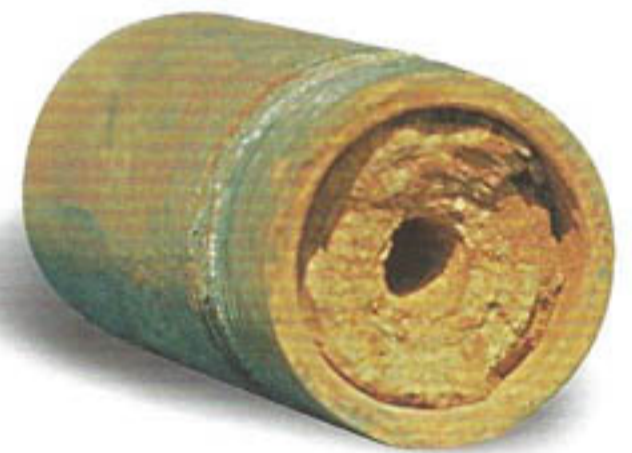
Scale and lime build-up inside copper plumbing due to hard water contaminates.

Unsightly rings around the bathtub and soap scum tiles are a result of soap reacting with hard water. This messy substance adds hours of extra housework and requires harsh, expensive, toxic cleaners.